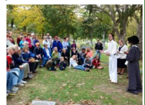
Winona (Minnesota) Historical Society Cemetery Walk 2013