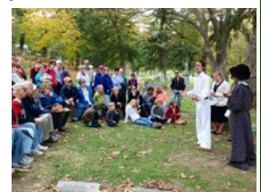
Winona (Minnesota) Historical Society Cemetery Walk 2013